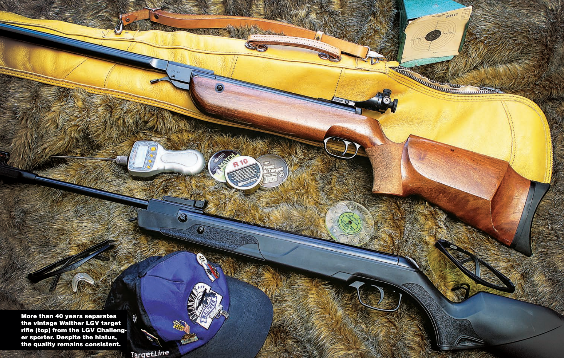
More than 40 years separates the vintage Walther LGV target rifle (top) from the LGV Challenger sporter. Despite the hiatus, the quality remains consistent.