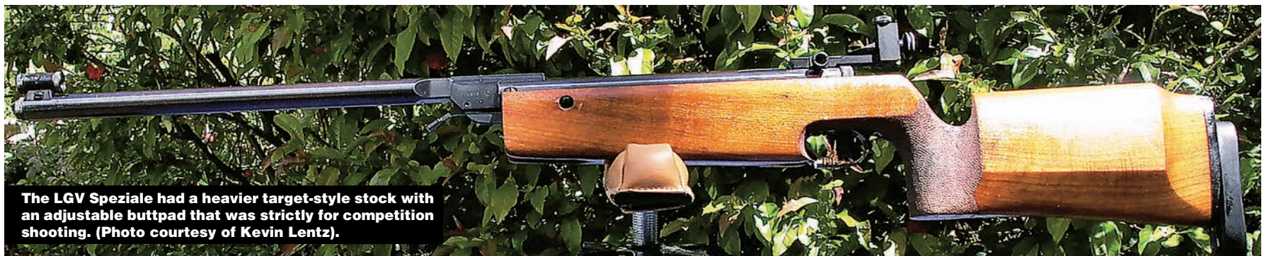
The LGV Speziale had a heavier target-style stock with an adjustable buttpad that was strictly for competition shooting. (Photo courtesy of Kevin Lentz).

Recoiling target rifles of the 1960s and '70s were equally accurate. Both the Weihrauch HW 55 and Walther