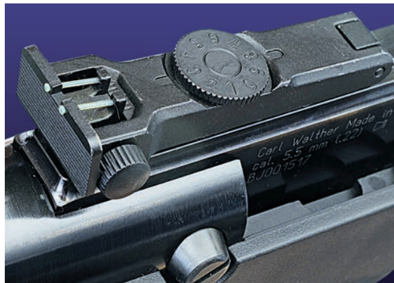
The Challenger rear sight has fiber-optics as well. It's adjustable in both directions with precision clicks. It's an effective alternative to scopes.