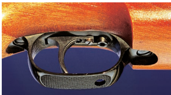
The original Walther LGV Olympia trigger is adjustable for length of first stage and letoff weight. This one is set to break cleanly at 12 ounces.