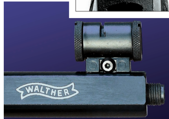
All of the new LGV models have threaded muzzles, which allow installation of accessories like silencer tubes. A knurled protective ring is provided.