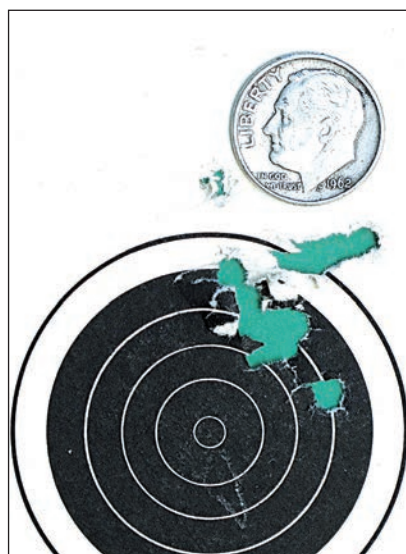
When the rifle is as good as the LGV Challenger, you can expect groups like this one, which measures .989". Shot with .22 cal. JSB Exact RS pellets.