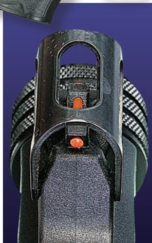
The Challenger's front sight has a fiber-optic rod at the top of a squared-off post. Generous open holes in the hood admit lots of light to the rod.