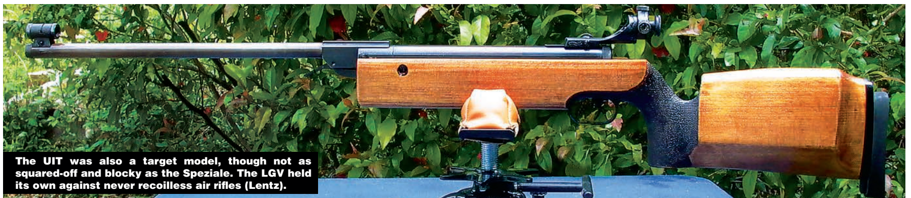
The UIT was also a target model, though not as squared-off and blocky as the Speziale. The LGV held its own against never recoilless air rifles (Lentz).