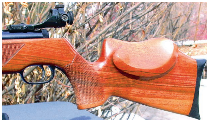
Tyrolean-stocked target air rifles are rare because they were banned from competition soon after they appeared. The LGV Tyrolean is especially rare. (Lentz).

LGV had the ability to win championships, even in the presence of the newer crop of recoilless wonders such as the FWB 300 and Anschütz 250. Indeed, in 1969, an HW 55 won the European Championship—although it was the last recoiling spring-piston target air rifle to do so.