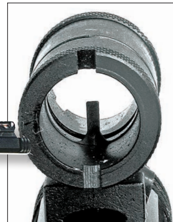
The LGV Master Ultra has a front sight globe with interchangeable inserts that's better suited for formal target shooting than the fiber-optic sight.