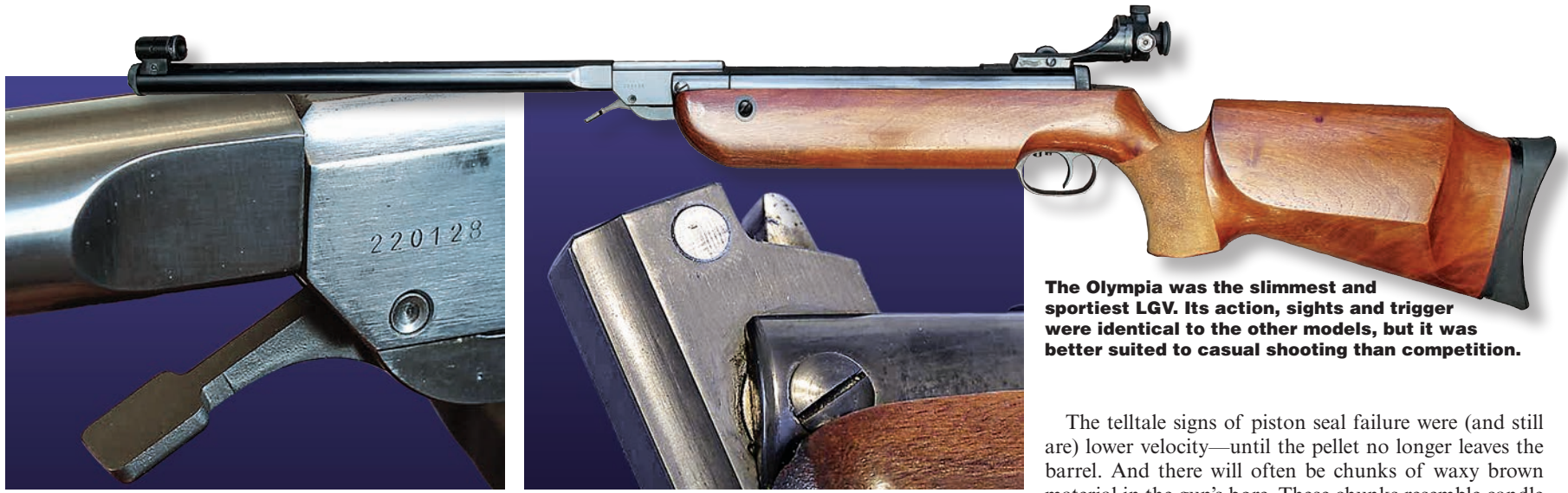
The barrel latch at the fore-end tip must be pressed up to release the barrel for cocking. The LGV was the first Walther breakbarrel to have this feature.